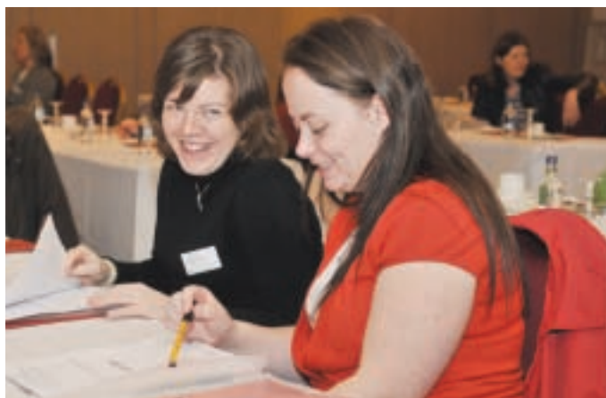
Sharing a light moment!