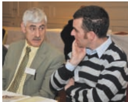
Networking at the national conference.