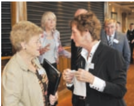
Networking at the national conference.