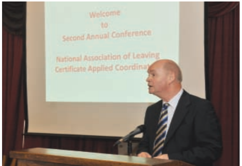
Pat Carey, T.D. Government Chief Whip and Minister of State at the Department of the Taoiseach opens the second annual conference

As you will all be aware we are currently experiencing a challenging economic environment and, in framing the budget this year, a range of very difficult policy choices had to be faced by the Government across all areas of public expenditure, including in the field of education. While education remains a priority for the Government, it has been necessary to curtail expenditure in some areas. Among the areas affected is the Leaving Certificate Applied where the special grant has been ceased with an estimated saving of €1.2 million. However, I